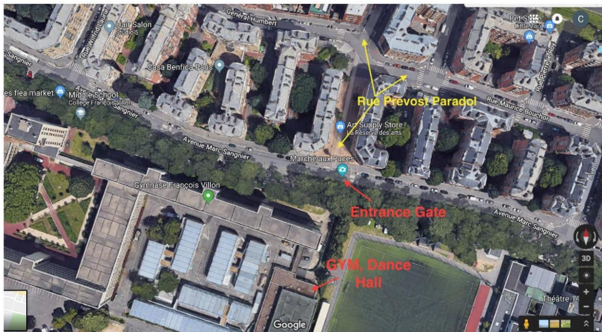
Picture 4: View from above of the Lycée François Villon / Lycée Louis Armand complex