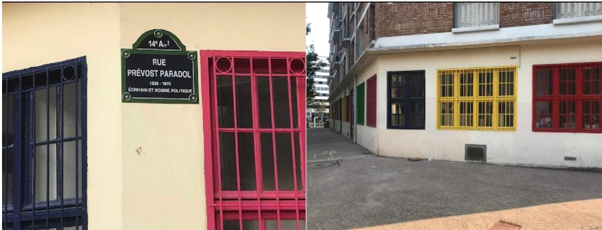
Pictures 2 and 3: View of rue Prevost Paradol, opposite the entrance gate